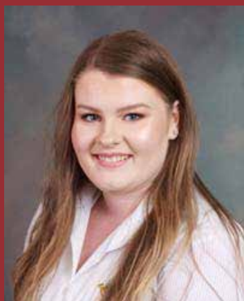
Emma Lindsay Scholarship in - Photography