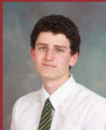
Thomas Hanson Scholarships in - Physics, Statistics, Chemistry and Calculus