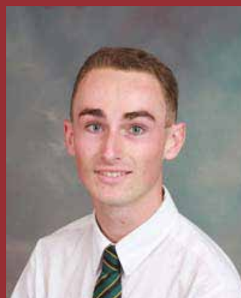
Cameron Page Scholarship in - Chinese