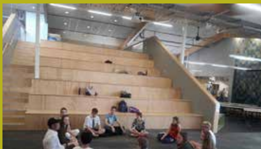
Drama improv workshops

News from M block – We did our first Performing Arts Camp back in February. 44 Students and 17 members of staff took part in 12 workshops and 2 concerts. Students could opt into Dance, Drama, Music, or Sound and Lighting workshops, and most had a taste of all four.