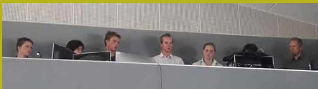
Sound and Lighting team talk