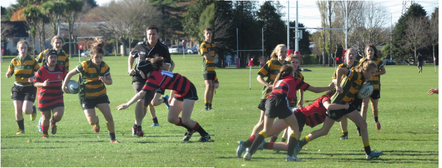
Pictured above the Girls 10s in action last Wednesday at College Day. They came 3d.