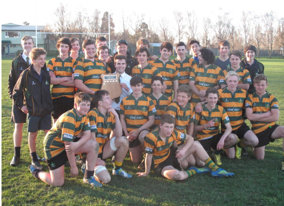
Above: The victorious Wednesday 2 nd XV squad