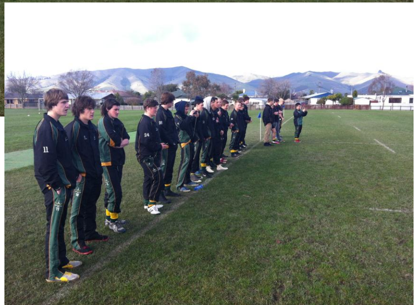
Right: The boys support the U15 team.