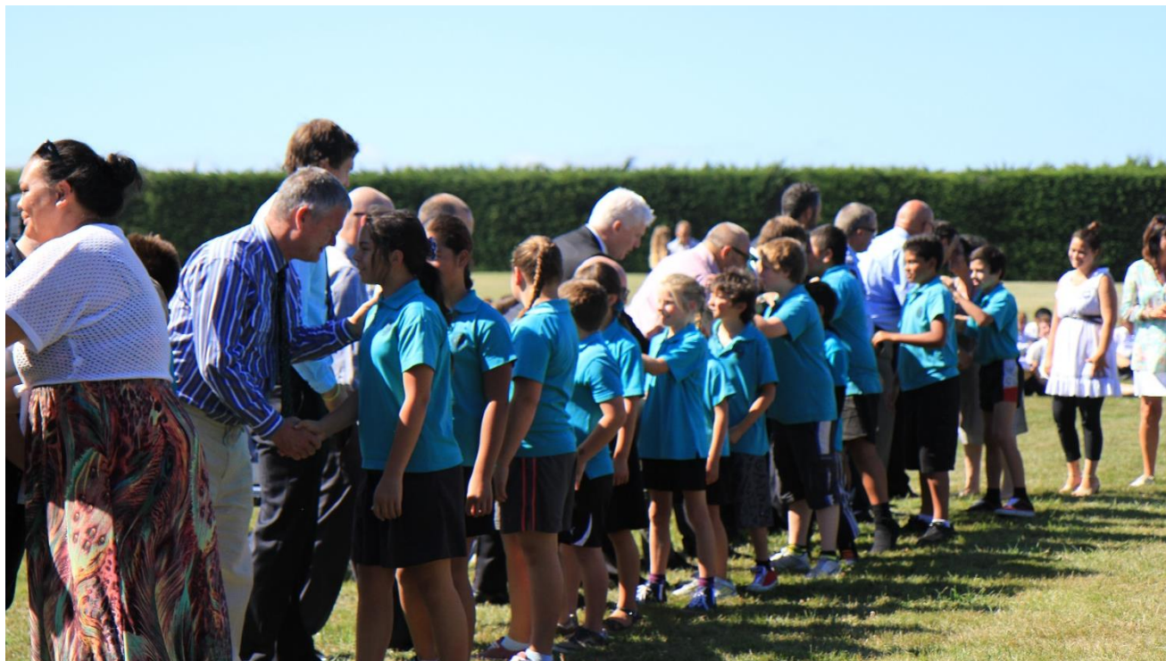
Students from Tuahiwi School